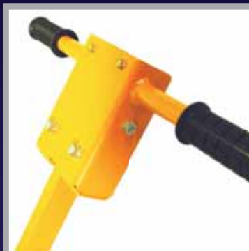
Vibration Damping Comfort Handle