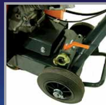
Depth Adjustment Pedal