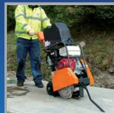
Pointer Guide For Improved Accuracy

A Range of Diamond Blades also available from the Belle Group.