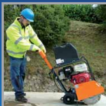
Easy To Operate