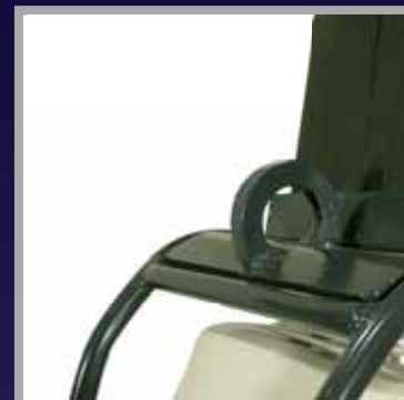
Durable Lifting Point